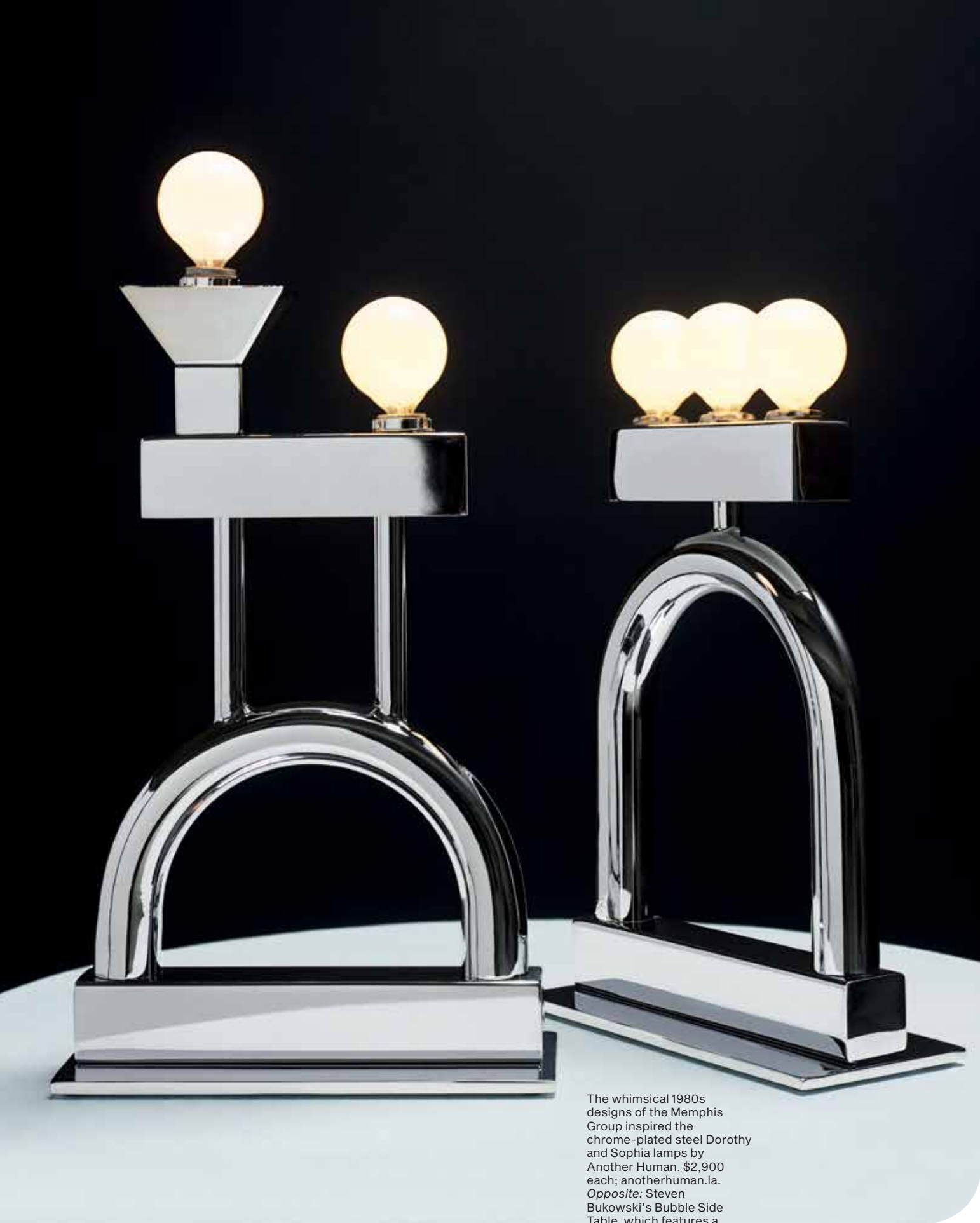
The whimsical 1980s designs of the Memphis Group inspired the chrome-plated steel Dorothy and Sophia lamps by Another Human. $2,900 each; anotherhuman.la . Opposite: Steven Bukowski's Bubble Side Table, which features a soft-close drawer, comes in lacquer or natural wood. $3,400; 1stdibs.com .